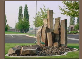
City of Othello

Basalt flows and ice-age floods shaped the predominate geologic features of the Columbia River Basin. Incorporate this heritage into your garden with basalt columns, paths of basalt gravel, and other garden features made of basalt; flood-tumbled rock; and ice-raftered erratics.