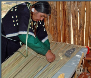
Terry Richard, The Oregonian

The tribes have inhabited the Columbia River watershed for thousands of years, utilizing its plant and animal resources. Incorporate the ethnobotany of the tribes into your Heritage Garden by including plants used for food, shelter, and medicines.