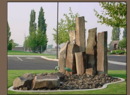
City of Othello

Basalt flows and ice-age floods shaped the predominate geologic features of the Columbia River Basin. Incorporate this heritage into your garden with basalt columns, paths of basalt gravel, and other garden features made of basalt; flood-tumbled rock; and ice-rafted erratics.